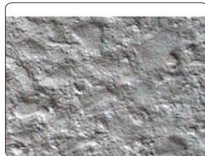
Heavy Abrasive Blast